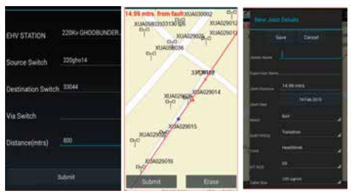
Fig 3: Fault Locator App on Mobile

The system provides near real-time operational view including outages, permit issued/put-back, & network operations to all Concerned stakeholders. This provides transparency at all levels and reduces excessive communication among the stakeholders.